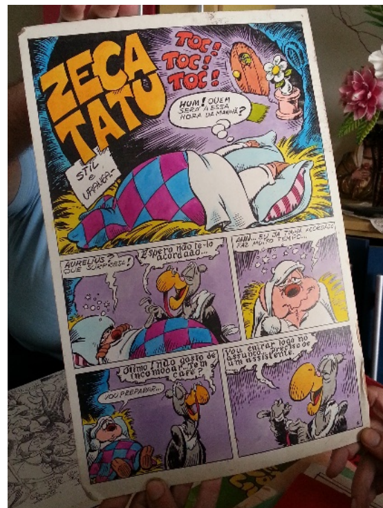
Figure 3 - Art by Zeca Tatu, comic book character created by Stil in partnership with Arturo Uranga.

The documentary project is still looking for support and sponsorship, however, after listening again and rereading the transcript of those days, we felt it was important to publish the contents of that interview, one of the last with Stil talking