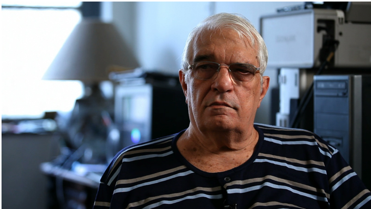
Figure 1 - Pedro Ernesto Stilpen, Stil. Image captured from the film Luz, Anima Ação by Eduardo Calvet.

Pedro Ernesto Stilpen, also known as Stil (Figure 1), is a great reference when it comes to Brazilian animation. He was one of the founders of Grupo Fotograma , in 1968, in Rio de Janeiro, which carried out several initiatives to promote animation with film shows and even a program specializing in animated cinema for the now extinct TV Continental . After the group’s dissolution in 1969, he later funded Grupo NOS alongside Rubens Siqueira and Antônio Moreno. In the following decades, in